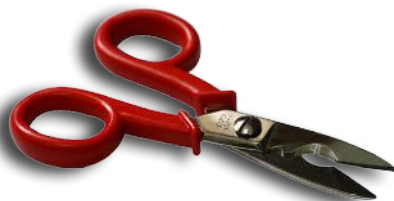
SPECIAL COAX SCISSORS