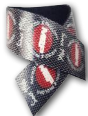
ADHESIVE REUSABLE VELCRO