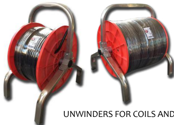
UNWINDERS FOR COILS AND BOBBINS