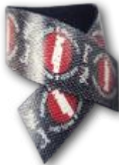
ADHESIVE REUSABLE VELCRO