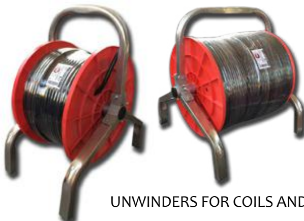
UNWINDERS FOR COILS AND BOBBINS