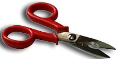
SPECIAL COAX SCISSORS