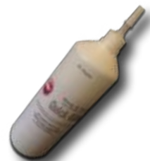
CABLE PULLING LUBRICANT