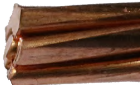
Cut made with special M&P scissors.

7 Insert the connector and fasten accurately until the o-ring present in component A, will be pressed against the connector body. Inside, the rubber component C (pic. 1) will expand, granting optimal sealing against moisture and a perfect contact to ground.