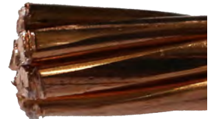
Common scissors: remember to use a file in order to remove the copper in excess. Make sure to follow the stranding direction.