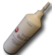
CABLE PULLING LUBRICANT