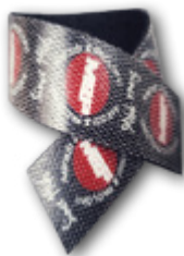
ADHESIVE REUSABLE VELCRO