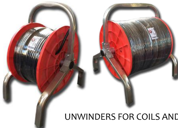
UNWINDERS FOR COILS AND BOBBINS