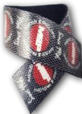
ADHESIVE REUSABLE VELCRO