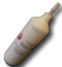
CABLE PULLING LUBRICANT