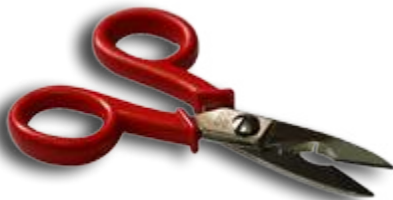
SPECIAL COAX SCISSORS