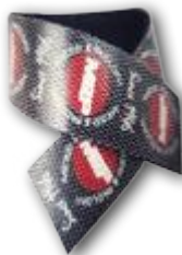
ADHESIVE REUSABLE VELCRO