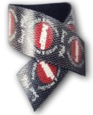
ADHESIVE REUSABLE VELCRO