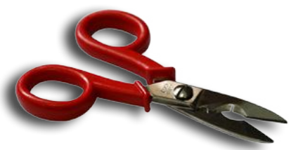
SPECIAL COAX SCISSORS