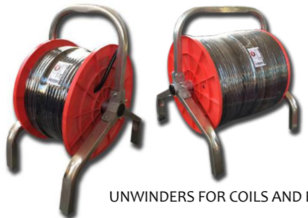
UNWINDERS FOR COILS AND BOBBINS